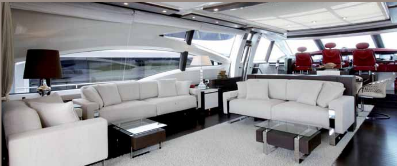
Grande 103SL "Gogamigoga" ITALY