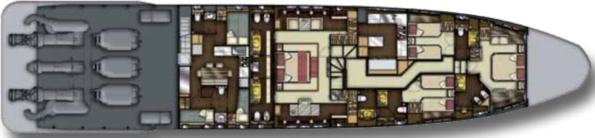
Optional version with 5 private cabins on the lower deck.