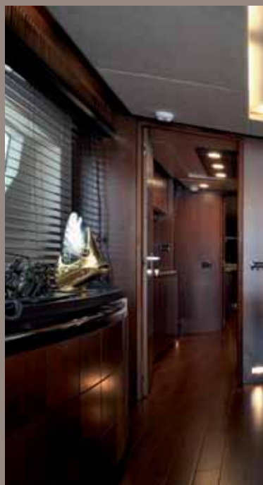
Grande 116 "Vivere" USA