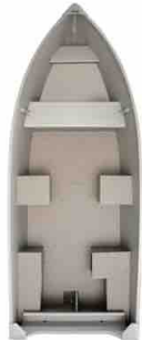
Shown with optional floor