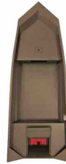
MV 2072 Tiller