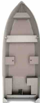
Shown with optional floor