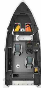
Voyager 175 CS