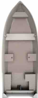
Shown with optional floor