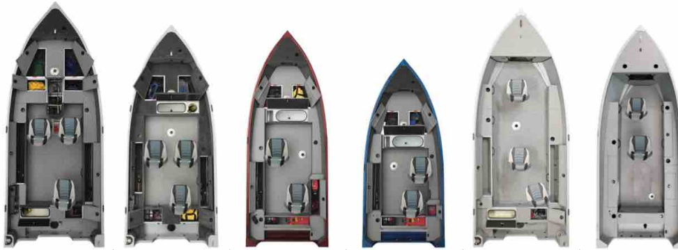
Voyager 175 Tiller Classic 165 Tiller Escape 165 Tiller Escape 145 Tiller Summit 180 Tiller Summit 165 Tiller